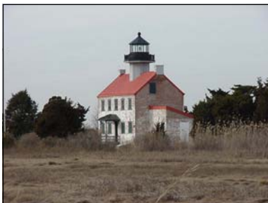
East Point Lighthouse