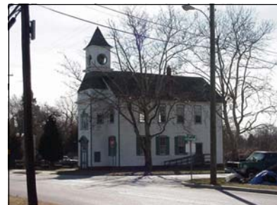
Union Hall, Downe Township