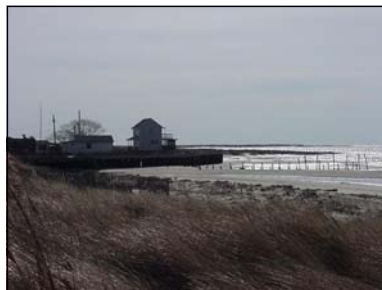
View of the Delaware Bay