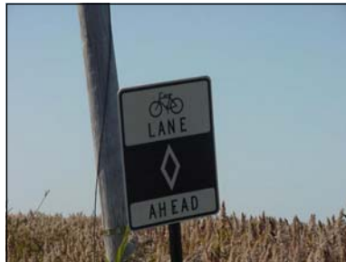
Bike Route, Bivalve, Commercial Township